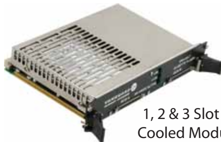
1, 2 & 3 Slot Air Cooled Modules VME, cPCI