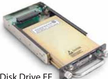
3 1/2" Disk Drive FF Removable Drives