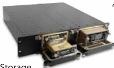
100 Mbit Network Attached Storage