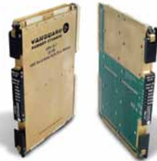
1, 2 & 3 Slot Conduction Cooled Modules VME, cPCI