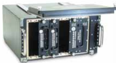
FC 4 Gb/sec Modified 4U 19" Rack