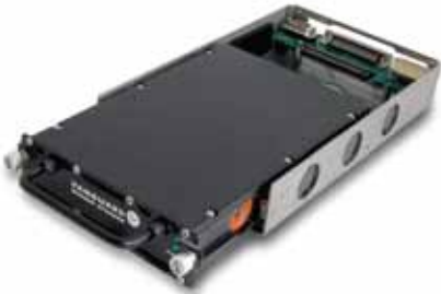
5 1/4" Half Height FF Removable Drives