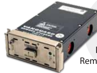
Legacy FF Removable Drives