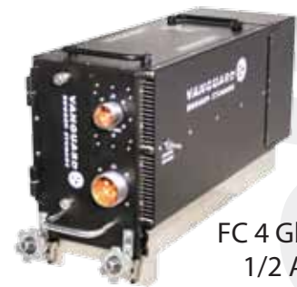
FC 4 Gb/sec 1/2 ATR