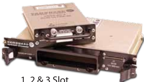
1, 2 & 3 Slot Removable Drive Modules VME, cPCI