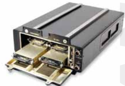
Gbit Network Attached RAID