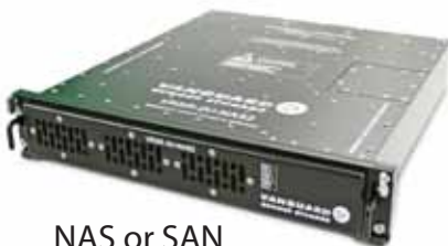
NAS or SAN 2U 19" Rack