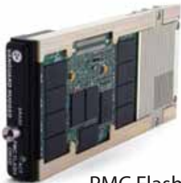
PMC Flash Disks