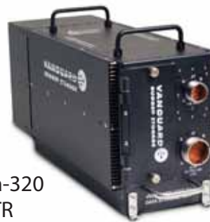
SCSI Ultra-320 1/2 ATR